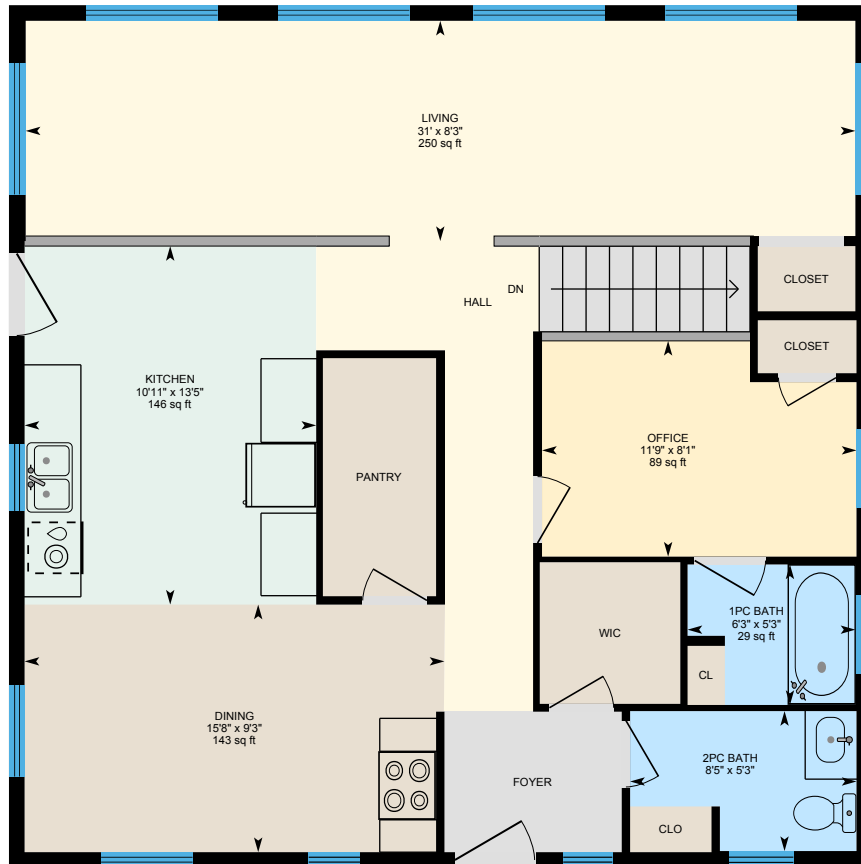
Main Floor Exterior Area 1038.10 sq ft

Main Building: Total Exterior Area Above Grade 1038.10 sq ft