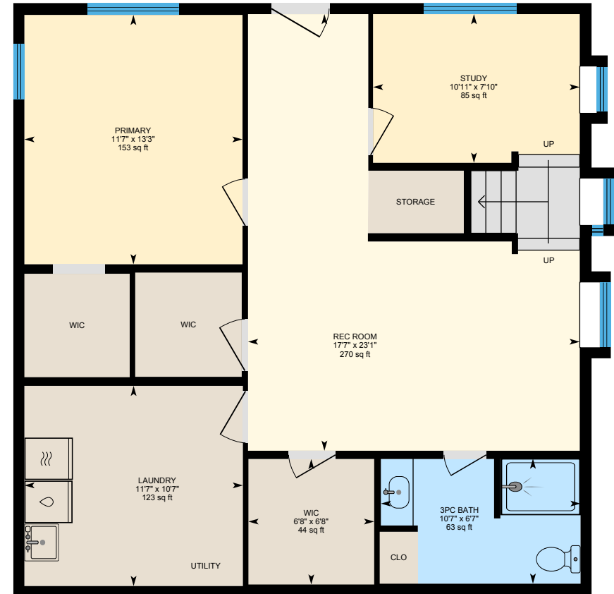
Basement (Below Grade) Exterior Area 961.26 sq ft